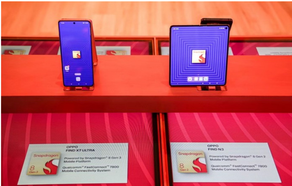
Oppo Find X7 Ultra and Oppo Find N3 at Qualcomm booth

Meanwhile, a series of Oppo innovative products, including the Oppo Find X7 Ultra and the Find N3 series, is also being showcased at Google's Android Partner Walk, demonstrating the comprehensive cooperation between Oppo and Google in creating smarter user experiences over the years.