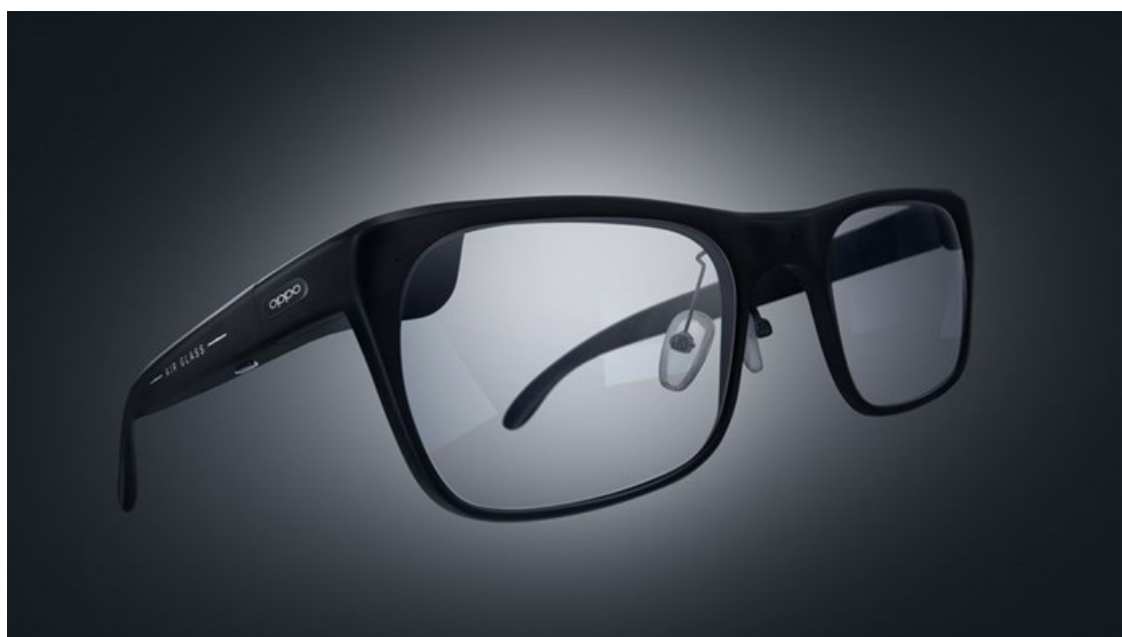
Oppo Air Glass 3 prototype

Weighing just 50 grams, the Oppo Air Glass 3 features a self-developed resin waveguide with a refractive index of 1.70, a display brightness uniformity of more than 50%, and a peak eye brightness of more than 1,000 nits. Together, these ensure the Oppo Air Glass 3 provides a wearing experience that is close to that of a regular pair of glasses while also providing the best full-colour display of its kind. Thanks to the access to Oppo AndesGPT provided by the Air Glass APP on the smartphone, users only need to lightly press the temple of the Oppo Air Glass 3 to activate the AI voice assistant and begin performing a range of tasks.