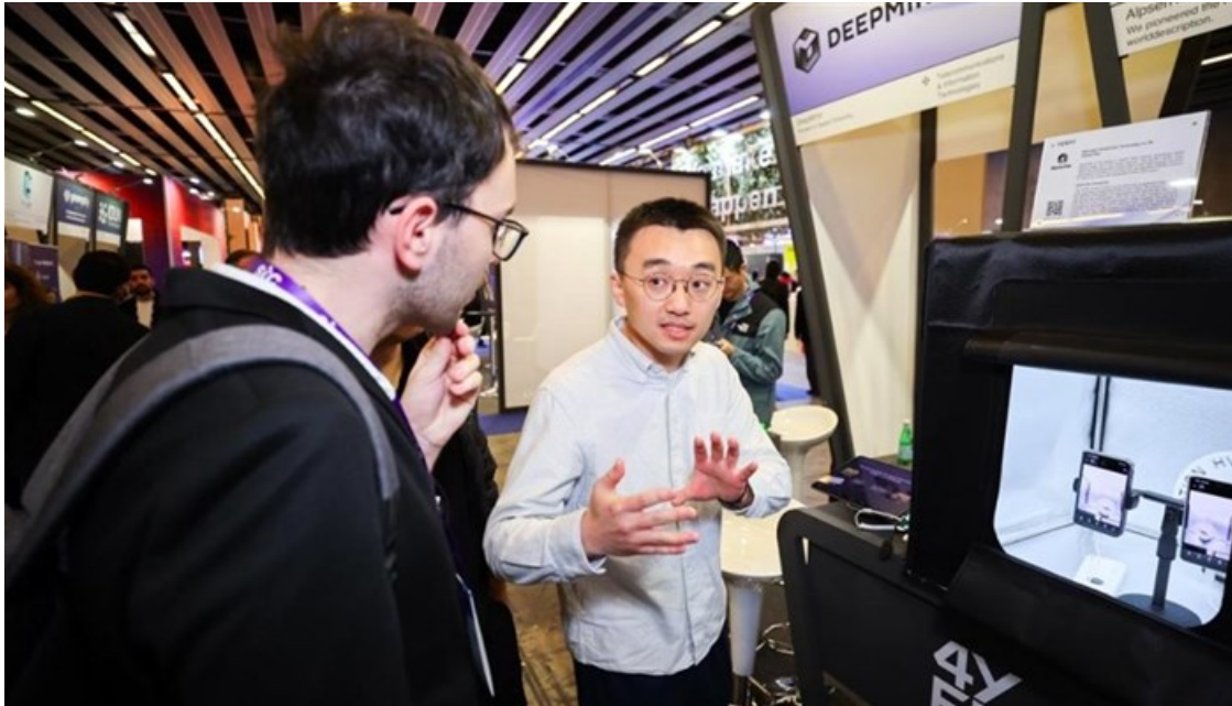
Startups at Oppo Inspiration Zone

Oppo's global monthly active users reached more than 600 million across more than 60 countries and regions in 2023. According to the World Intellectual Property Organisation (WIPO), Oppo ranks among the top six PCT (Patent Cooperation Treaty) filers in 2022.