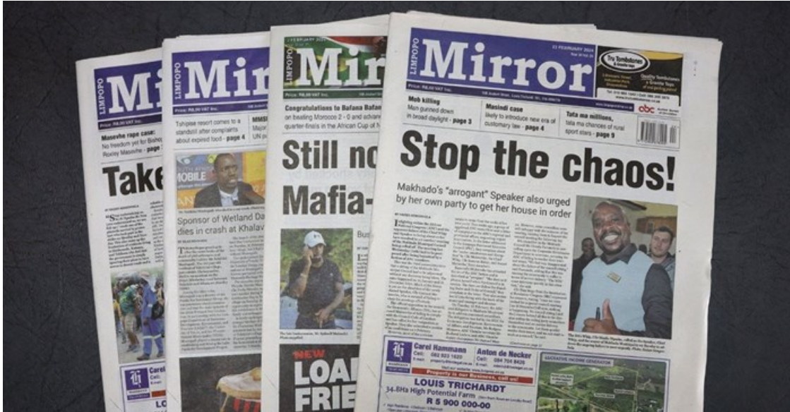
The Limpopo Mirror is published in Louis Trichardt, a town in the north of South Africa's Limpopo province.

This week the Competition Commission is probing how online news is affected by AI chatbots, search and advertising technology. The outcome of the hearings is important for the future of news reporting in South Africa. In this article we try to explain why local news publishers are under threat.