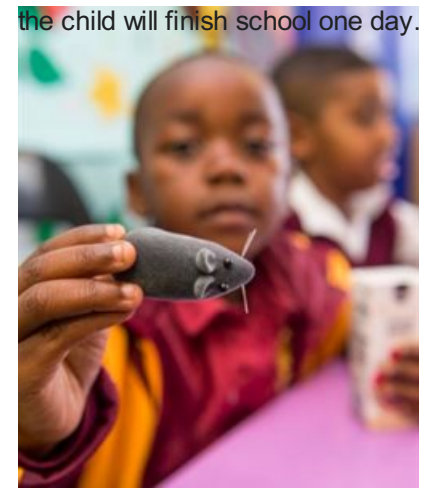
The joy of reading was sparked on World Read Aloud day as learners from eight Cape Town schools, read the same sweet children's story together.