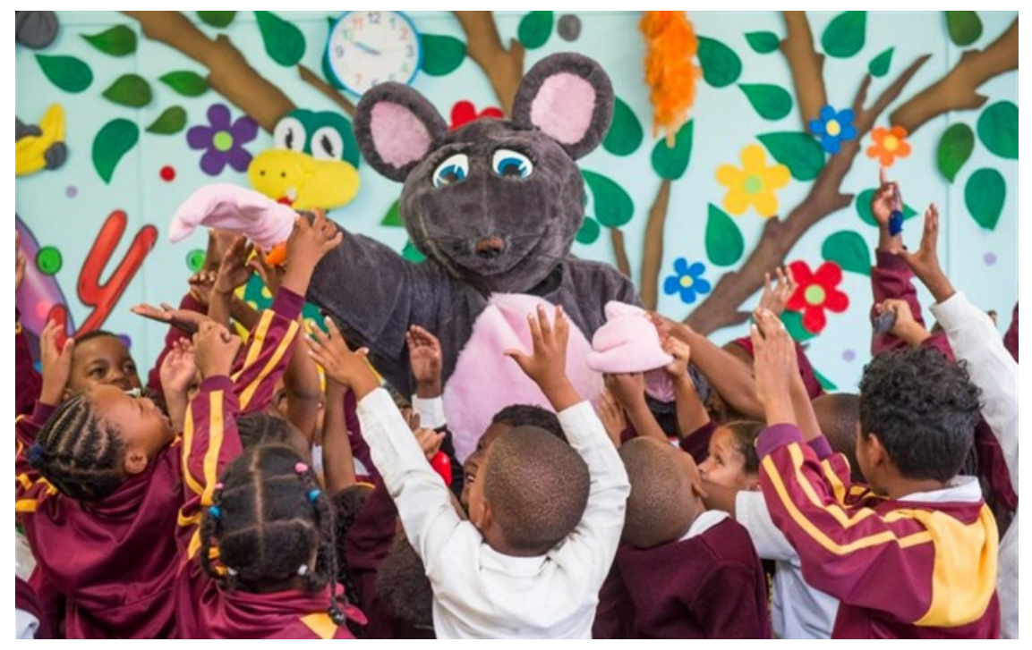
Coronation and its literacy partner Living Through Learning hosted the city-wide occasion at the schools' fun-filled Reading Adventure Rooms.

Coronation and its literacy partner Living Through Learning spread joy at all their beneficiary schools and Reading Adventure Rooms in Cape Town as the learners read The Mouse Who Ate the Moon.