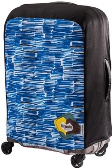
Samsonite and Uzwelo luggage cover

Bailey: The fact that we are always receiving different prints mean that no two covers will ever be the same - and so are truly unique. But far more importantly is our story of reinventing a use for fabric that was otherwise destined for a landfill site. Secondly, the employment opportunity creation element, which is hugely important to us, and finally that for each Uzwelo Bag, a 5% donation is made to The Bateleurs Conservation Organisation.