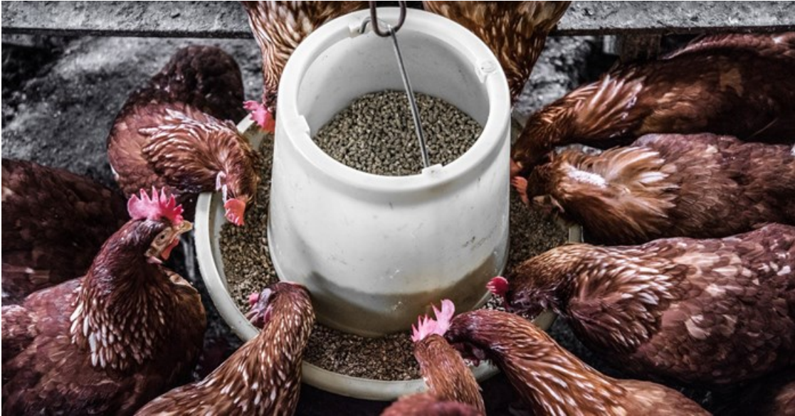
Chicken feed is one of the rising costs of farming.

The University of Georgia's Poultry Science Department, in collaboration with funding from the World Poultry Foundation, has introduced the FeedMixer app. This solution aims to tackle one of the most pressing challenges faced by chicken farmers across the globe: optimising chicken feed in the face of soaring commercial feed costs and limited access to specific grains.