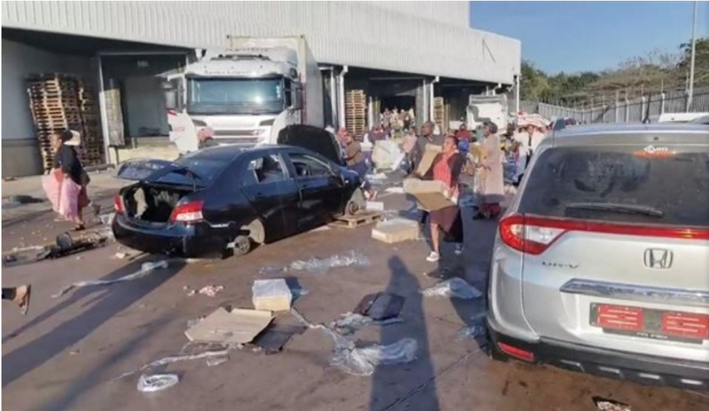
Demonstrators loot the Ayoba Cold Store in Chesterville, Durban, KwaZulu-Natal, 12 July 2021, in this still image obtained from social media video.

The recent political and social unrest across parts of South Africa has again brought to the fore the deep structural problems faced by the nation. These include high levels of poverty for an upper-middle income country, largely due to extreme income inequality, which means that a large segment of the population is much poorer than the average, and massive unemployment.