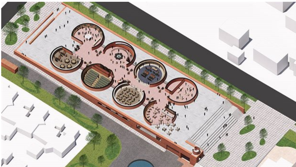
Ground Floor Level.

This memory, embedded within the intelligence of the African consciousness, now sees a typology of learning and a typology of sustenance materialise into form.