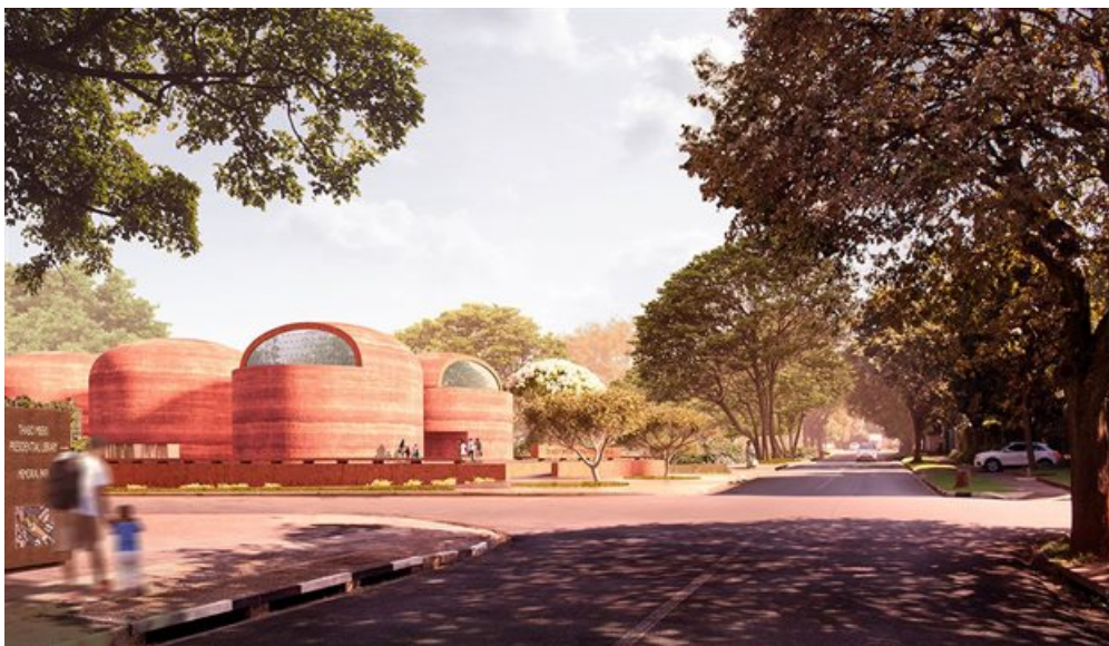
Intersection between North and Main Avenue.

"Sited in Riviera, Johannesburg, the library will harbour the knowledge of the land whilst acting as a space for connection in which the advancement of an African renaissance becomes the premise of the structure."