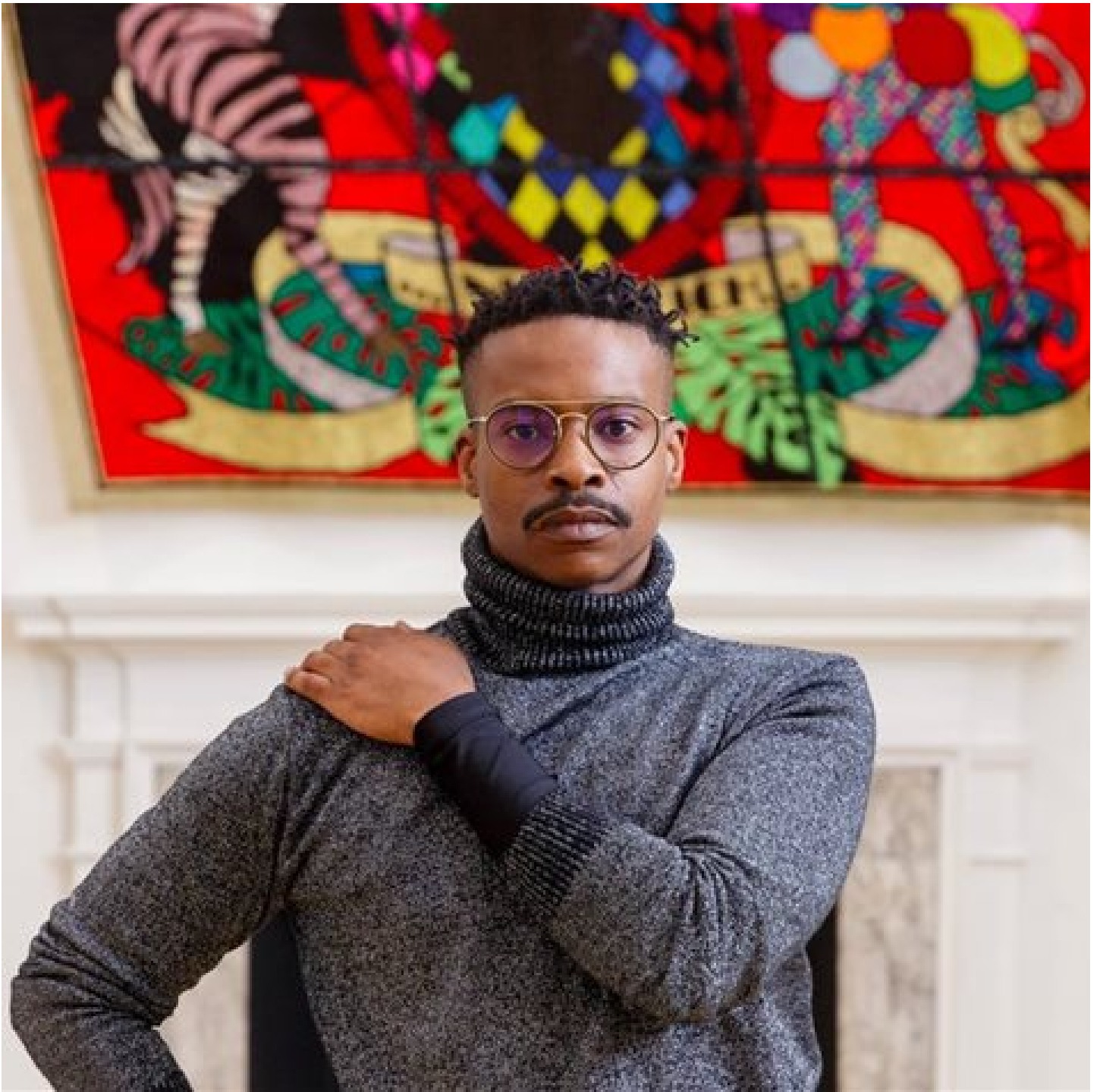
Pictured: acclaimed South African artist Athi-Patra Ruga collaborates with Zeitz Mocaa