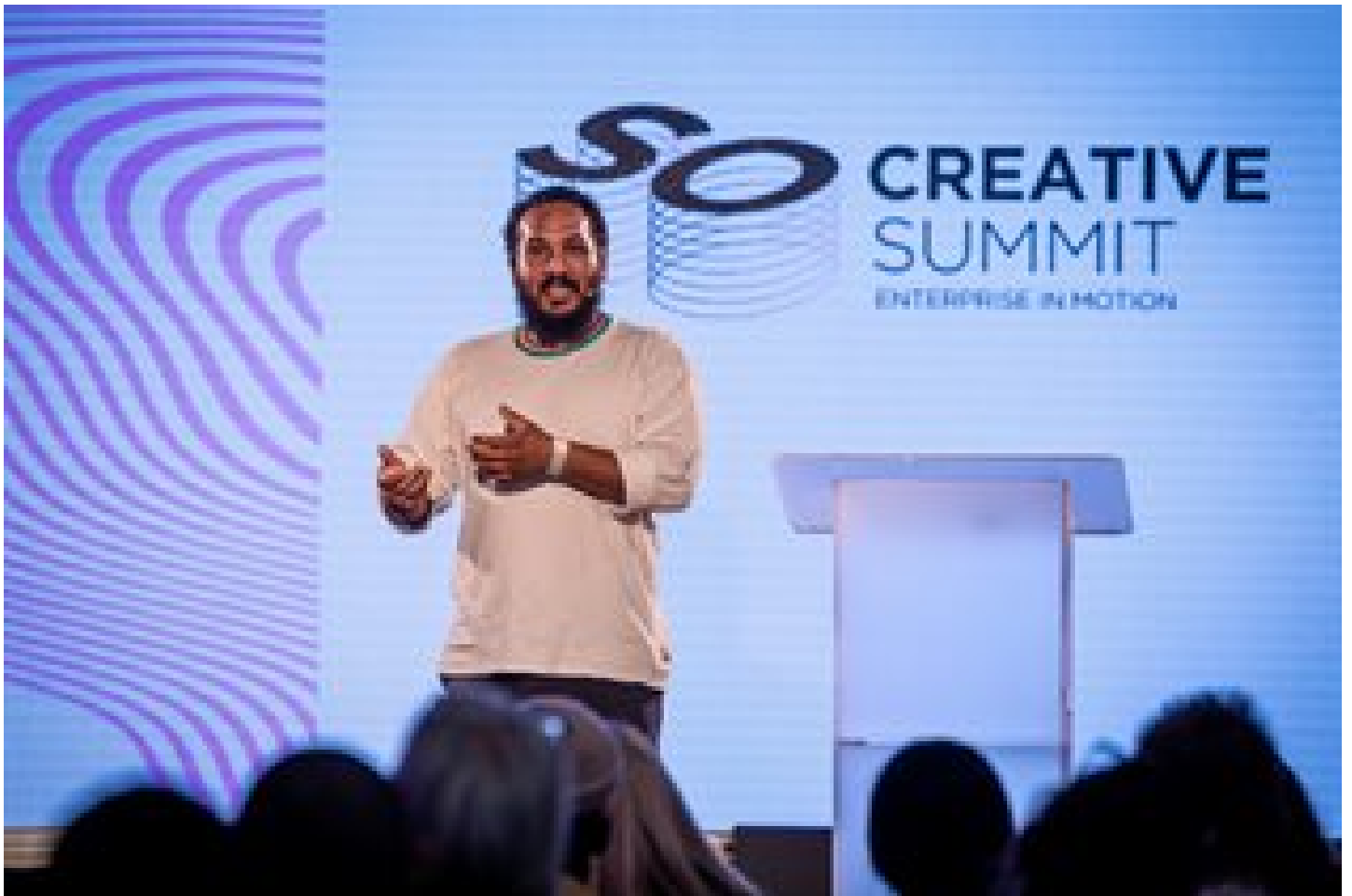
This year's theme, Emergence, reflects a focus on recalibrating existing creative systems and fostering new ways of thinking. The program boasts an impressive line-up of 54 speakers and contributors from 11 countries, including South