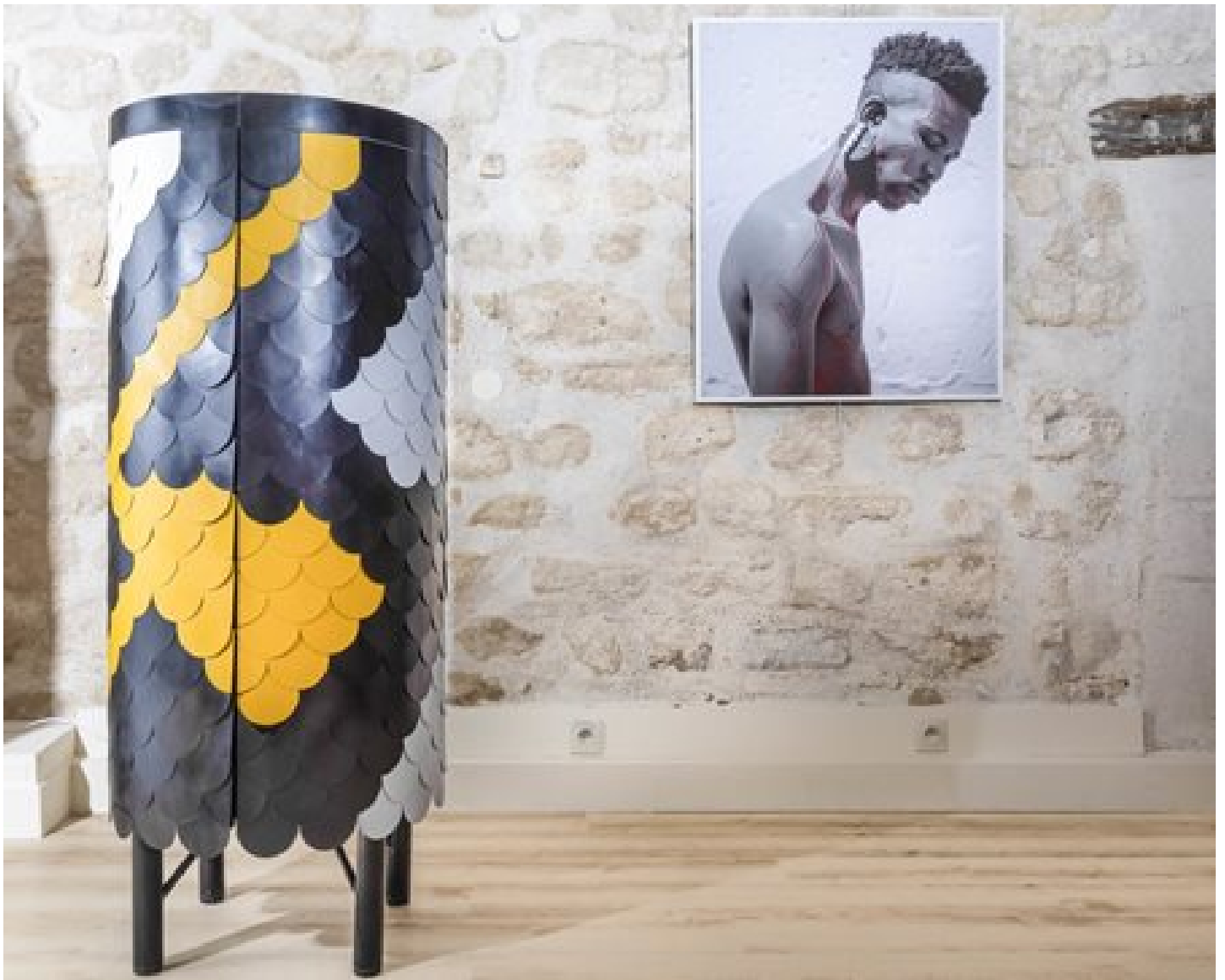
Mojo cabinet and Tutu 2.0 lamp.