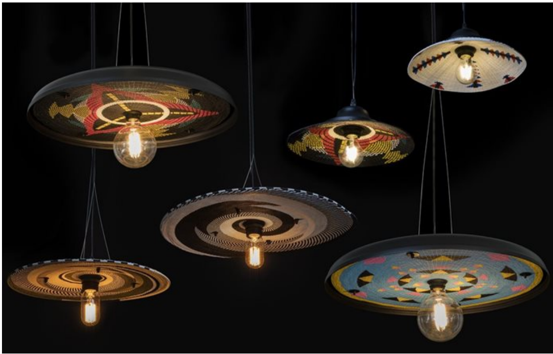
Alfred's Lights.

Telephone wire weaving is a longstanding local artisan practice rooted in the 1960s, when Zulu night watchmen started weaving scraps of telephone wire around their traditional sticks. The practice became popular among Zulu communities, and today there is great creativity in the use of this medium.