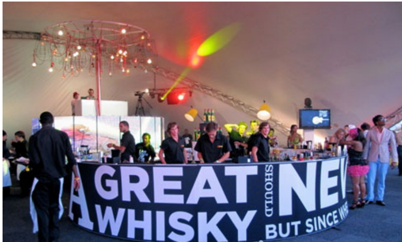
The new Thirst Saturn bar units launched at this year's J&B Met VIP marquee

Thirst Bar Services have soared to the top of South Africa's premium mobile bar market. The last 12 months has seen the company grow at a phenomenal rate, with Thirst being present at a huge majority of South Africa's premium events, offering a complete mobile bar solution which includes sushi, cocktails, premium coffee, smoothies and even mobile DJ's. Thirst's bar options have also grown but have kept in line with their "premium" status and services, their bar counters are not just the run of the mill Perspex bars on wheels, Thirst bars include, their experience bars, which are made from stainless steel and can be in black, white or even branded or wrapped. The new Saturn bar is state of the art, it's 5.5 meters in diameter, lightweight, can fit up to eight bartenders and has a cloth branding surrounding it which can be branded and kept for future events and its even machine washable.