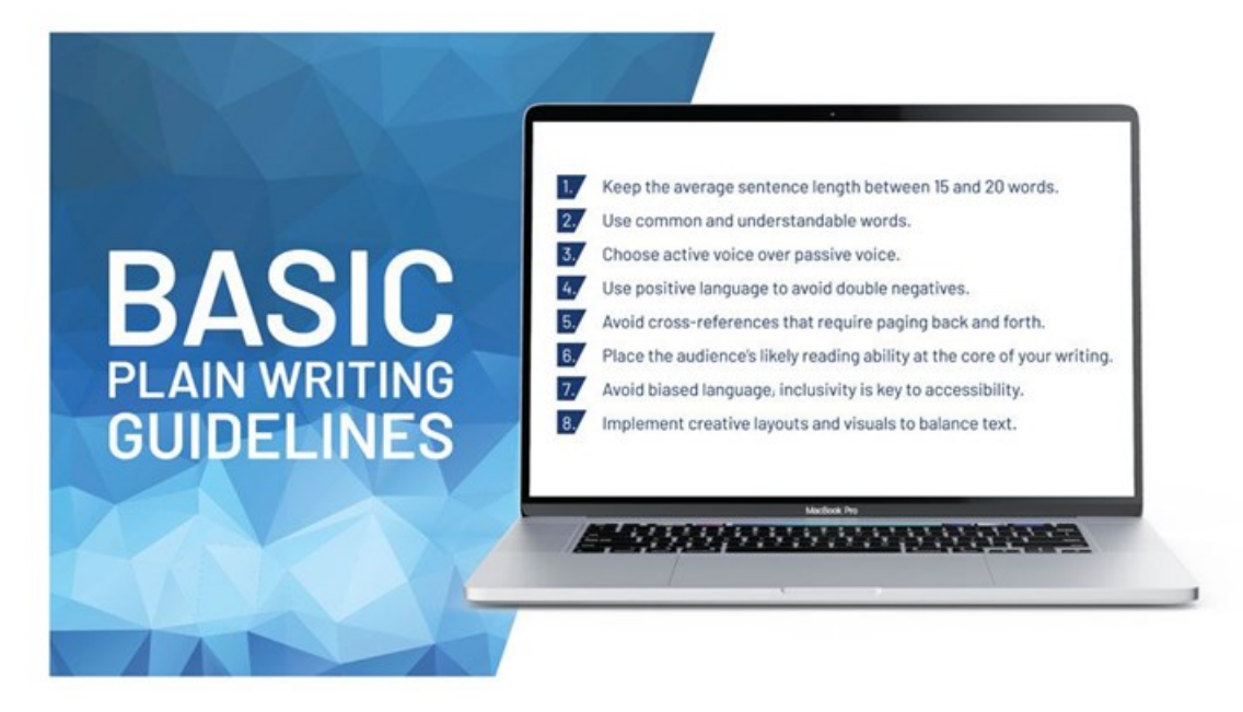
Figure 1: Summary of basic plain writing guidelines. (Source: EDGE Education (Pty) Ltd, 2023; adapted from Cutts, 2013: xxxi-xxxii)

However, plain language is so much more than a set of guidelines for writing effective content. In fact, it has evolved into a global movement that places itself at the centre of accessible and equitable communication.