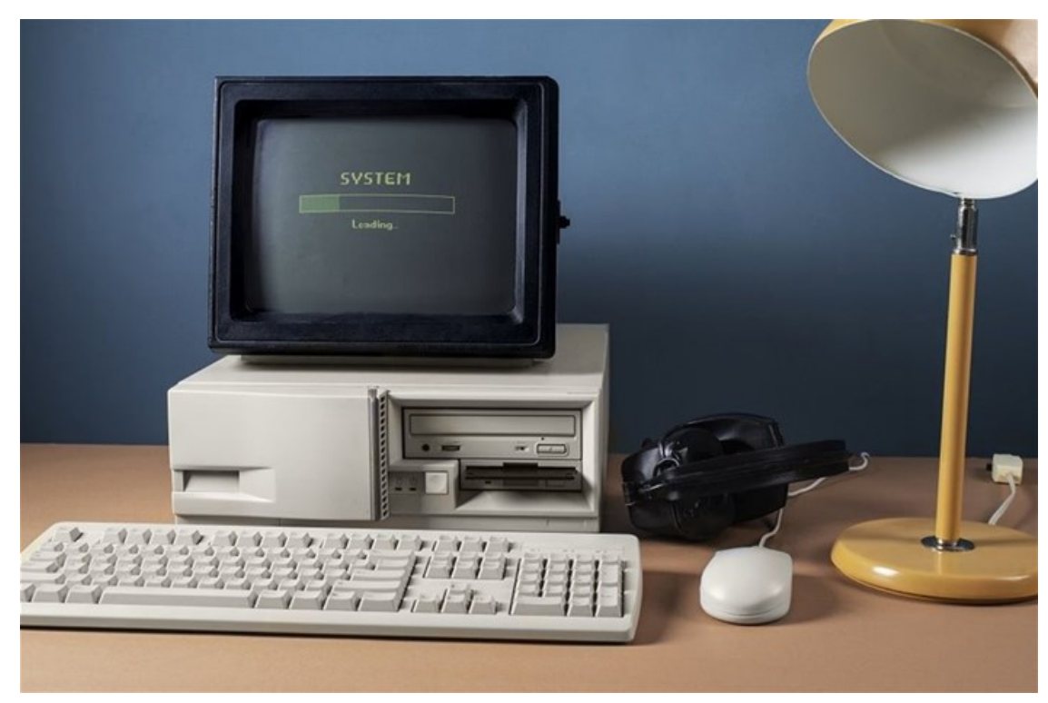
Web1 was the beginning, yet even then it was clear it would be the canvas on which the future would be painted

But...the lid opened and out came trolls, privacy issues, scammers and the worst of humanity. It is important to keep in mind that when we create something that seem as perfect it often contains the opposite as well.