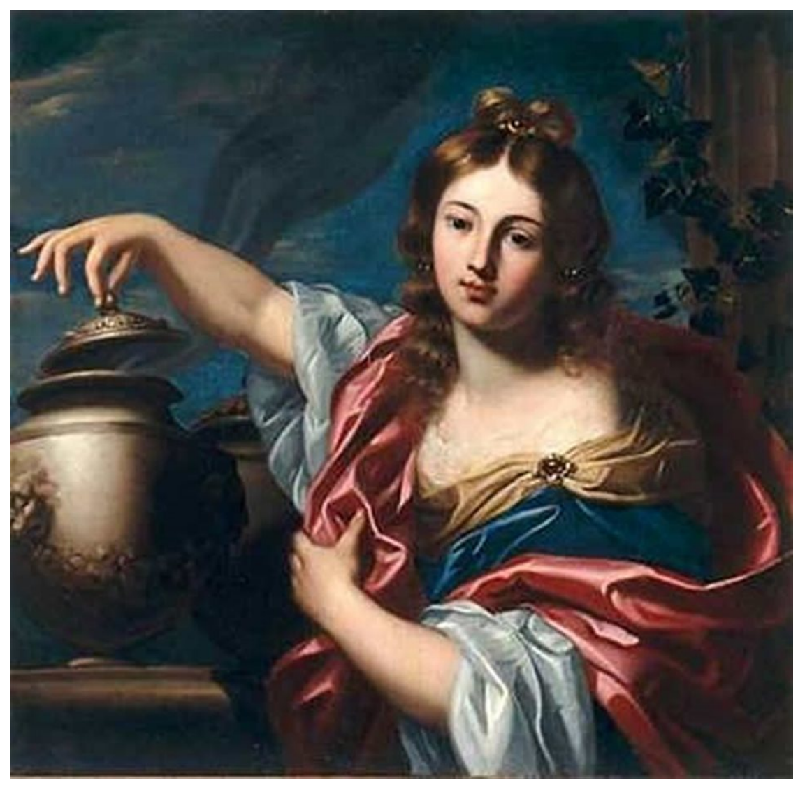
Contrary to popular belief that stems from a mistranslation, Pandora did not open a box, but rather, a jar.

Fire can literally mean, what we braai our meat on or what we used to become bronze-aged man, but also represents the internal fire of self-consciousness, creativity, and innovation. If you look at this story through a modern lens we can all agree that the gods were wrong to deny mankind our independence, our enlightenment, our fire.