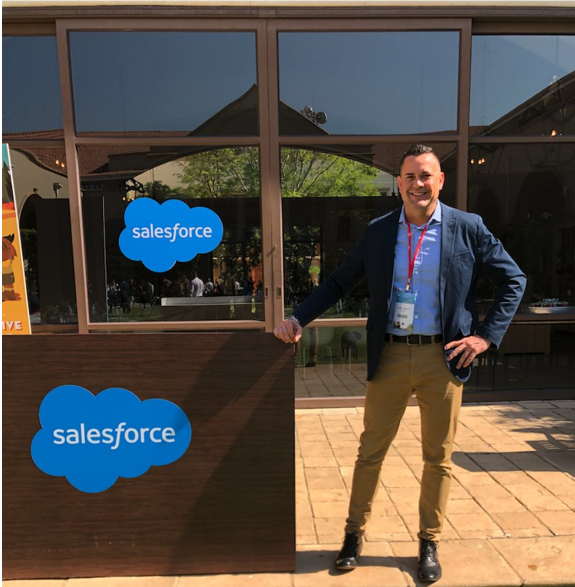
V5 Digital is an official Salesforce Partner

V5 Digital has been a proud Salesforce consulting partner since 2020, dedicated to helping companies in Africa and beyond unlock the full potential of their Salesforce investment. Our team is armed with the knowledge and experience to help businesses set up and optimise their use of Salesforce and in so doing, drive business growth.