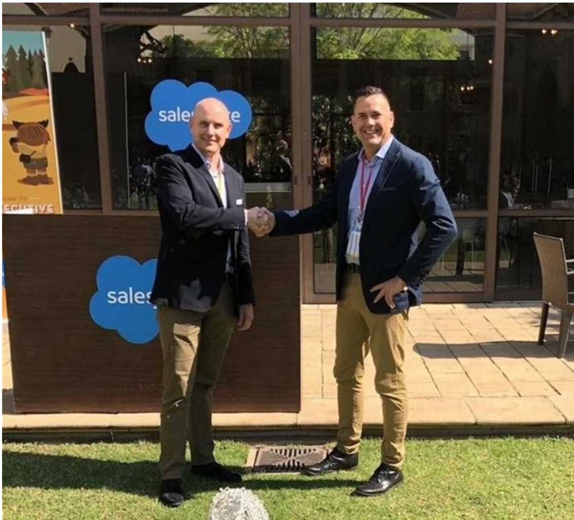
Salesforce, SharpSpring, and Rocketseed are V5 Digital's global customer success leaders