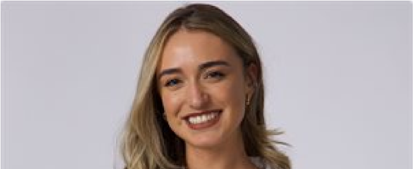
Joe Public Johannesburg