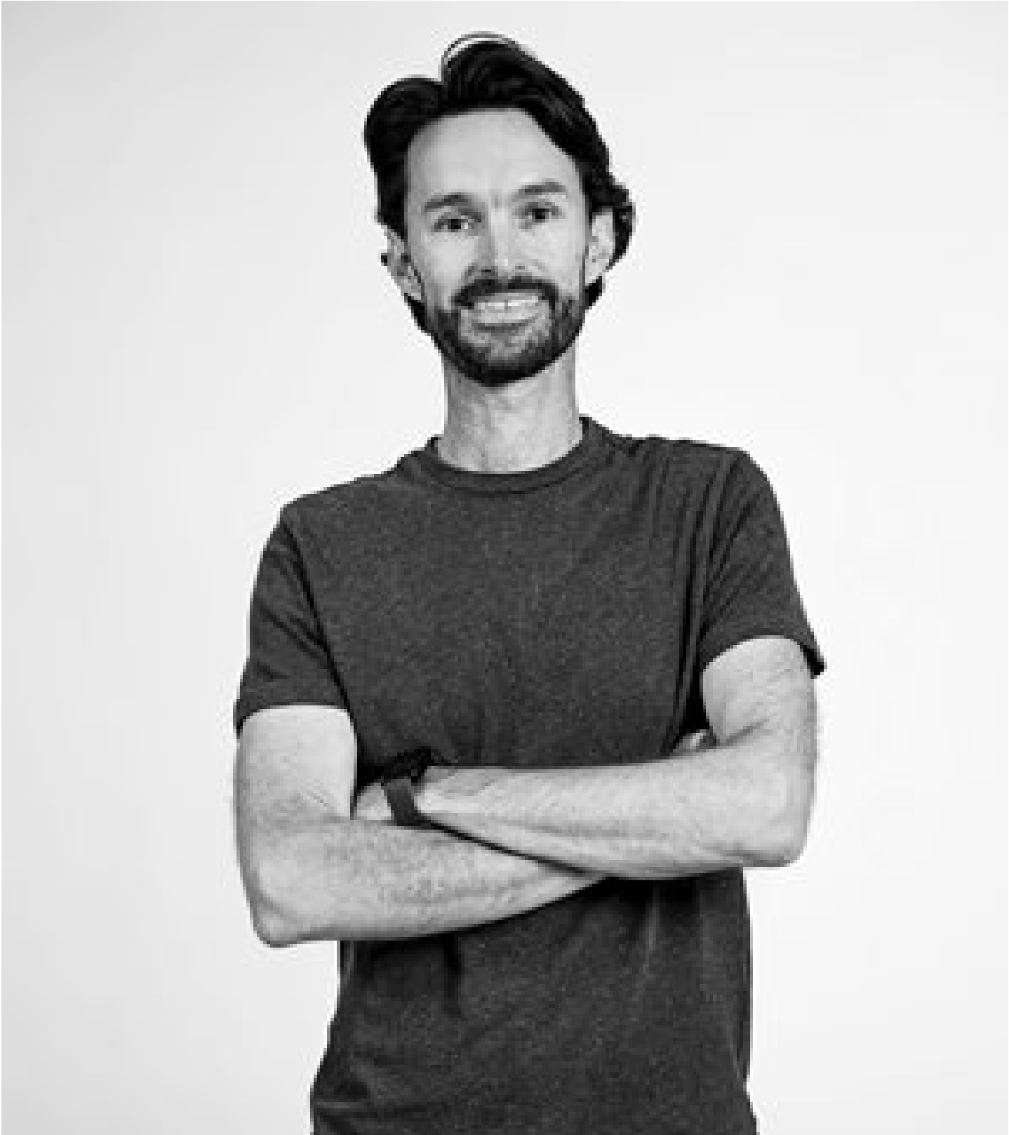
Joe Public Johannesburg