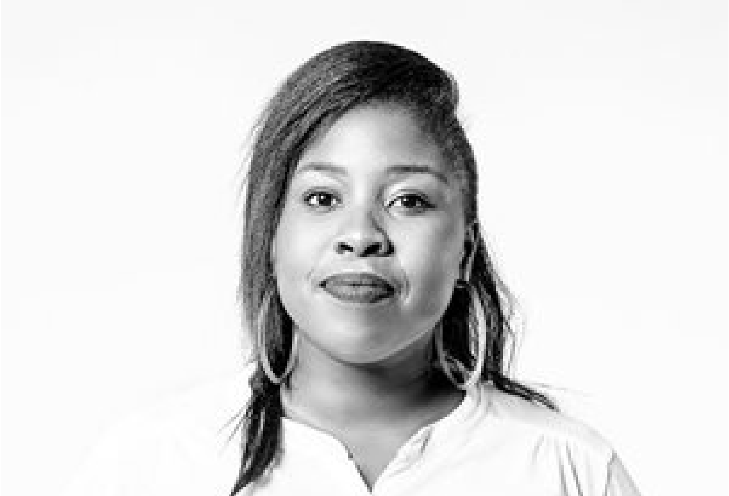
Joe Public Johannesburg