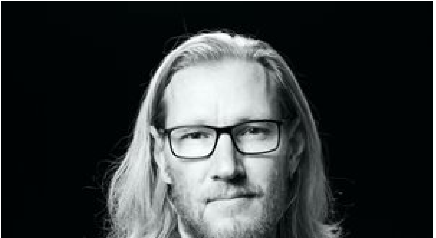
Joe Public Johannesburg