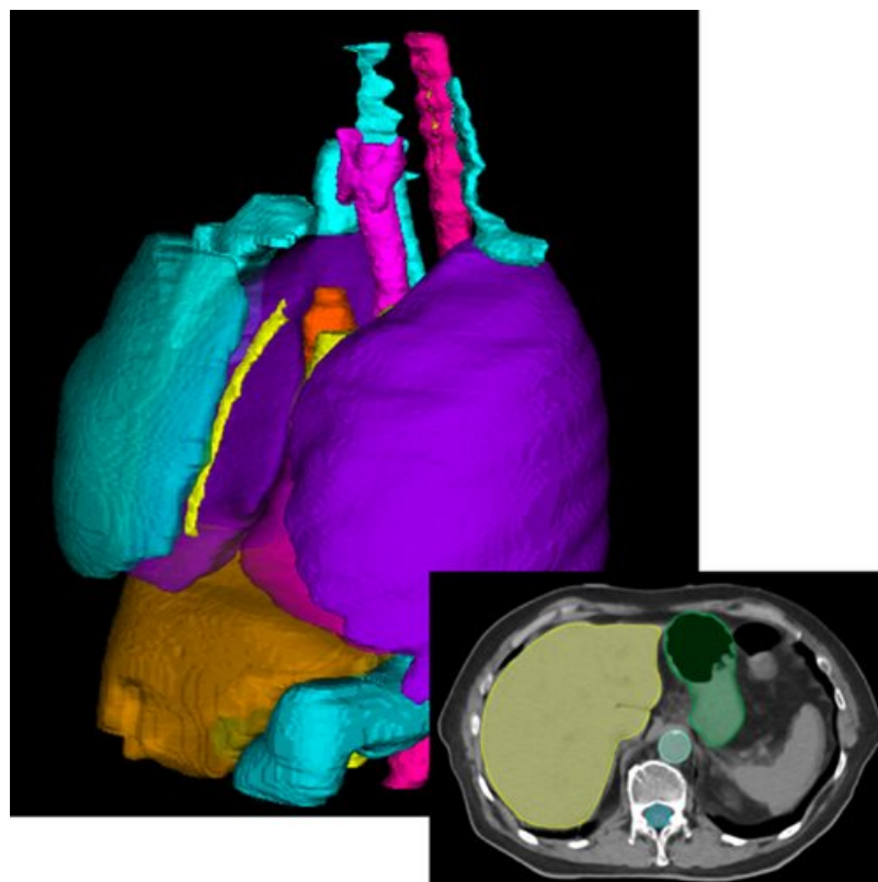
Thorax organs at risk (OARs)

“The planning process involves complex calculations, and we create a treatment plan based on a process called contour-mapping – a extremely precise drawing and mapping of organs which are at risk (OARs) when high doses of radiation are delivered to a tumour. This ensures that we can avoid damaging healthy tissue and target only the treatment area,” says Oelofse.