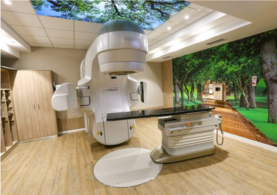
Icon Oncology commissioned a Varian Truebeam earlier this at its flagship integrated oncology unit based at Mediclinic Constantiaberg.