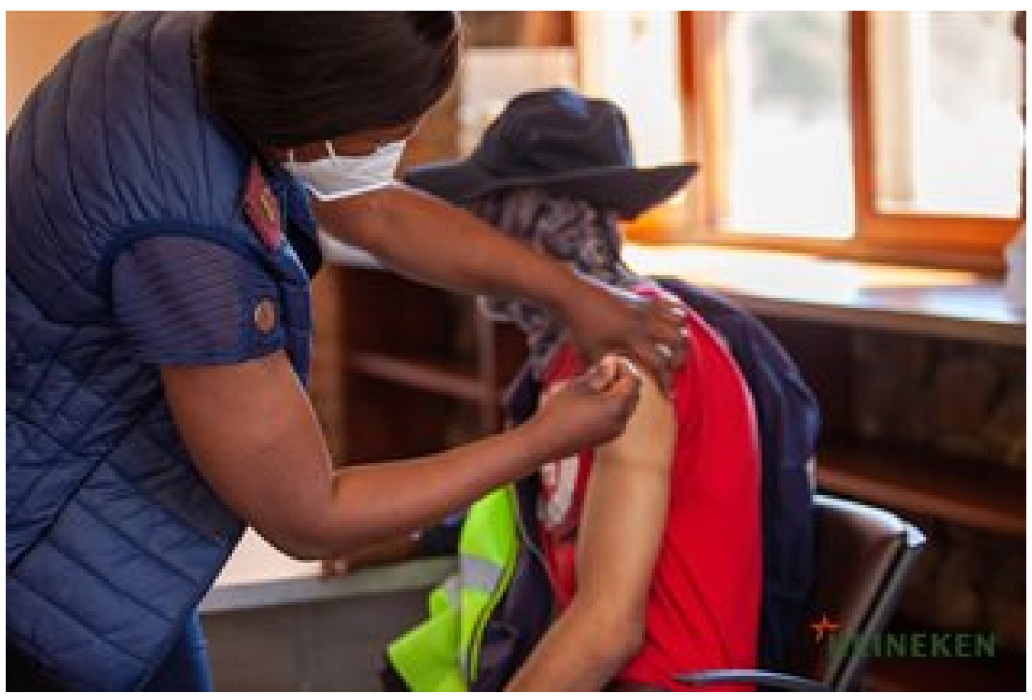
Employees being vaccinated at Heineken Sedibeng Brewery