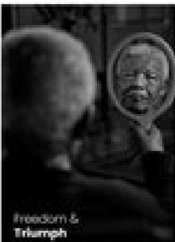
Freedom & Triumph