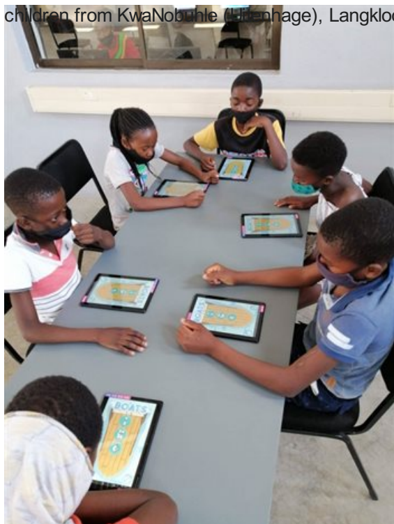
Great BOATS excitement at Good Work Foundation in Hazyview