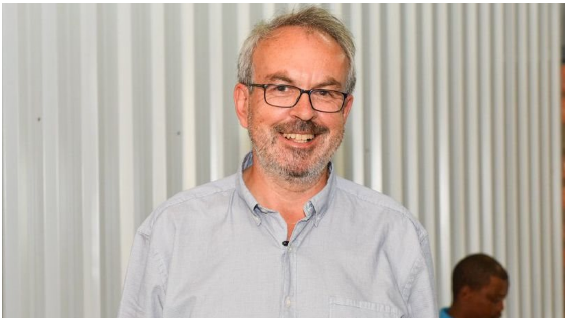
Prof Jean Greyling

“During the tournament, learners logged in from home to access the BOATS Android mobile coding app. They were taken through multiple choice questions that educated them about marine pollution and South Africa's cultural heritage. Up for grabs were TANKS school kits sponsored by LexisNexis South Africa, valued at R3,000 each. These kits introduce learners to coding concepts with the use of tangible tokens and image recognition, eliminating the need for a computer,” he explained.