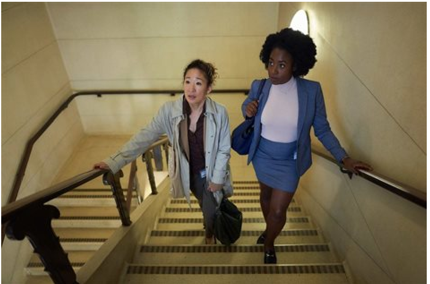
Killing Eve stars Golden Globe®, Sag® and Critics' Choice Award-winner Sandra Oh, well-known for her leading role in Grey's Anatomy , and Emmy® and Bafta-winner Jodie Comer. Nominated for the Best Drama Television series at the