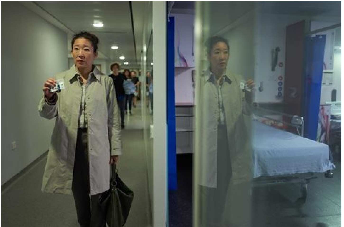
Sandra Oh in her role as Eve