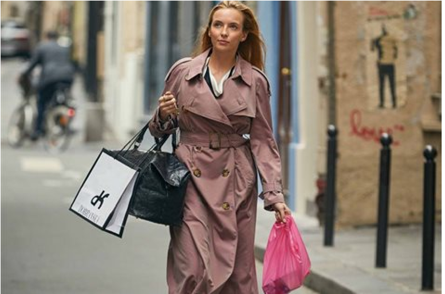
Jodie Comer in her role as Villanelle

Killing Eve topples the typical spy-action thriller as these two fiercely intelligent women, equally obsessed with each other, go head to head in an epic game of cat and mouse. This series, which combines brutal mischief making and pathos, is filled with sharp humor, originality and high stakes action.