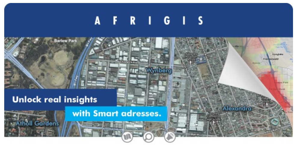
AfriGIS is a technology innovation company We provide easy access to quality location information and insights .

You can serve your customers better if you know where they are.