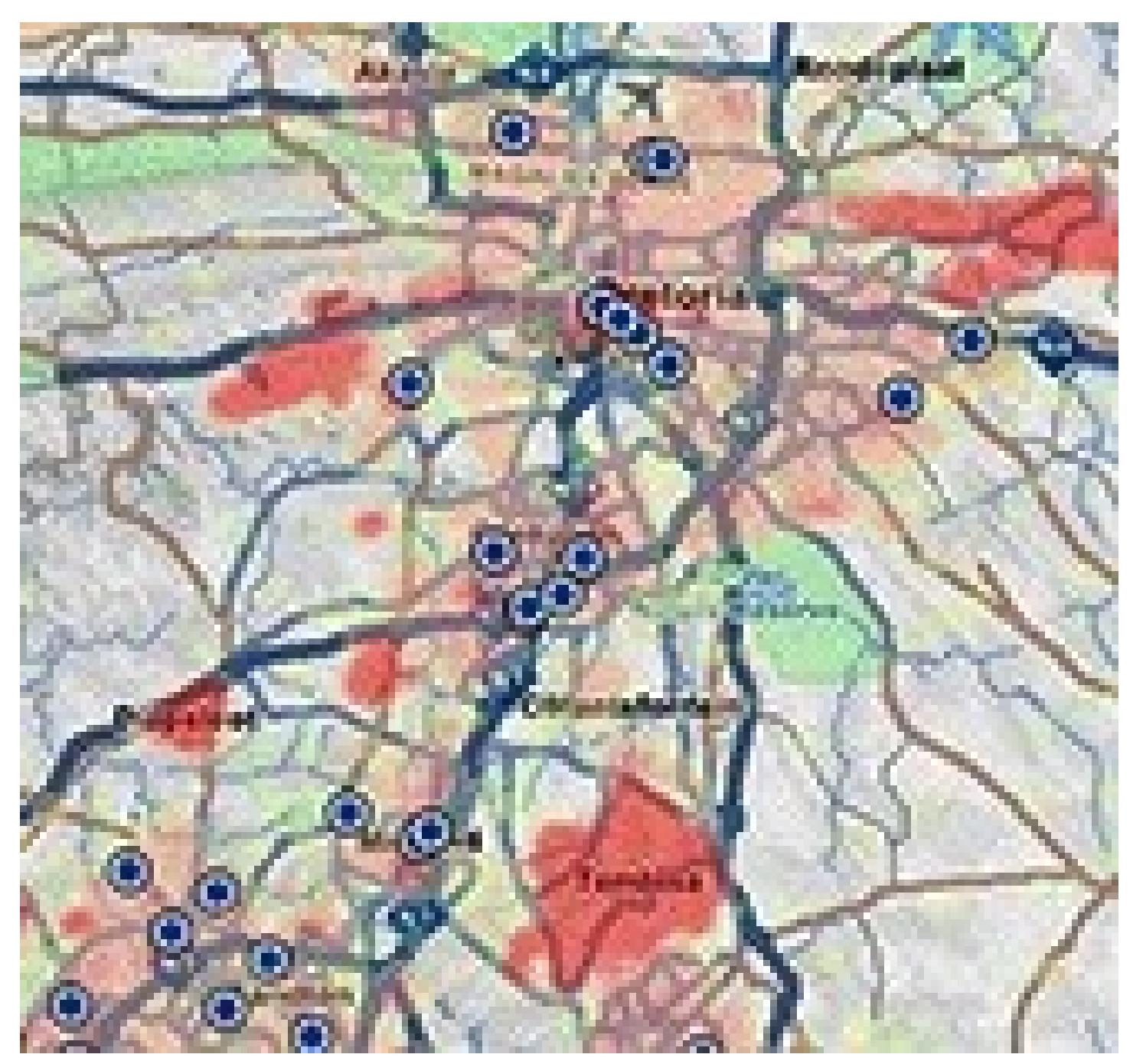
Heatmaps of activity