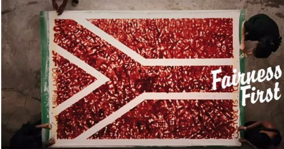
Screengrab from the 'Republic of Sexual Abuse' (RSA) video.

Unfortunately, gender-based violence is a harsh reality of everyday life for the majority of South African women. Here's what's being done to not just take a stand but also act to end GBV this #16DaysofActivism and beyond, with UN Women's global #OrangetheWorld campaign.