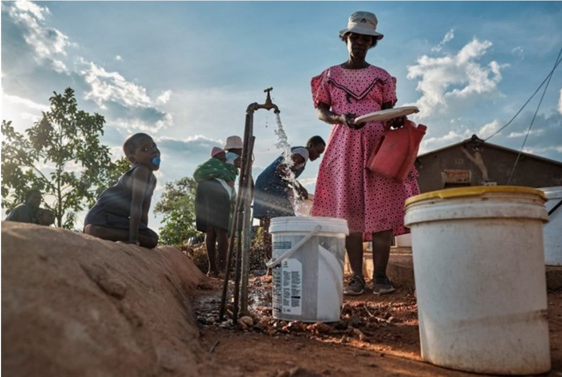
Residents queue to collect water, as temperatures soar during an El Nino-related heatwave and drought affecting a large part of the country, in Bulawayo, Zimbabwe, 7 March 2024.

The world just experienced its warmest March on record, capping a 10-month streak in which every month set a new temperature record, the European Union's climate change monitoring service said on Tuesday.