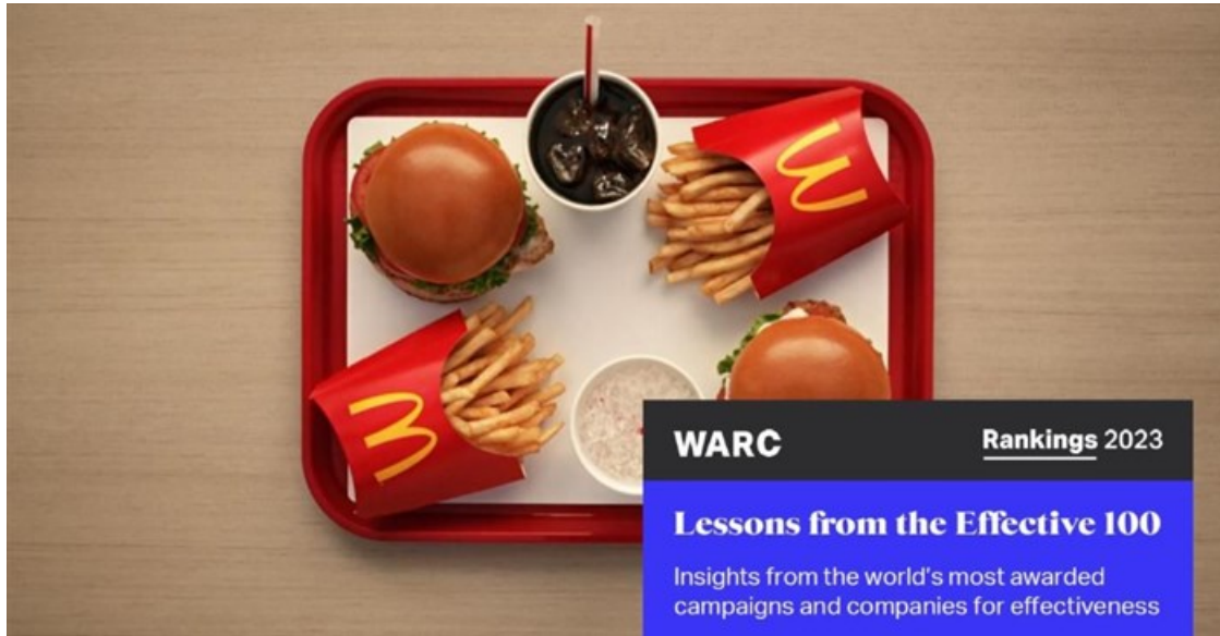
Warc Creative has released a report looking at the strategies and approaches of some of the world's most awarded campaigns for effectiveness from 2022, ranked in this year's Effective 100

The Warc Rankings: Lessons from the Effective 100 Brands find purposeful routes to growth, with tech innovation and social influence leading tactics for commercial success