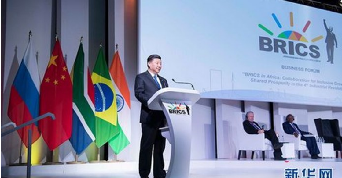
Chinese President Xi Jinping, BRICS Summit, South Africa.

The next decade will be a crucial one in which new global growth drivers will take the place of old ones. This is the view of Chinese President Xi Jinping, who shared his thoughts on the next 10 years at the BRICS Business Forum , held in South Africa last week.