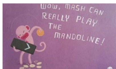
Mash the pink monkey, on one of Yuppiechef's hand-written thank you cards.

For example, Yuppiechef takes great pride in making sure that every single package it puts together for delivery has a handwritten card expressing gratitude, but when you're faced with a reality of days when there are 1000 orders going out, surely that sincerity is lost, and surely that will come through in the communication. Yuppiechef currently employs two full-time card writers, but in December it will take on an extra seven just to manage the load.